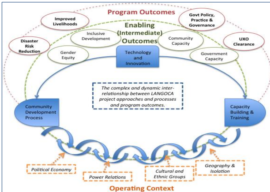
Figure 1: The Inter-relationships of LANGOCA elements and approaches